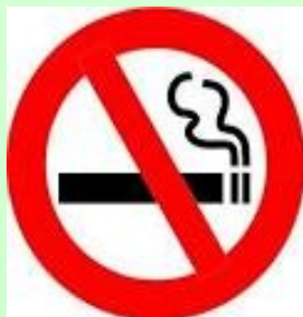
Or you are or have been smoking