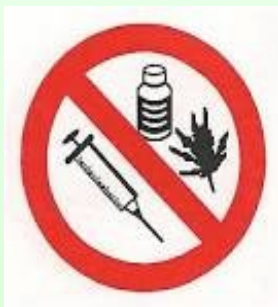
Drugs or prescribed medication that cause drowsiness

Do not share a bed with your baby while under the influence of;